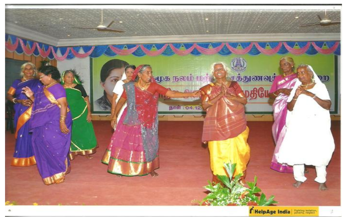
4.12 Our residents are activly involved in dancing on the occation of World elder's day program at DSW function