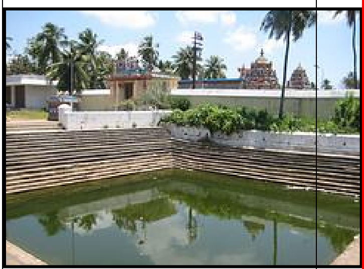
Shri Lakshmi Narashmma temple visit at singakiri for TEV