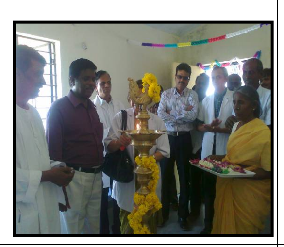
World Health Day Celebration at TEV For Cheep guest MGMCRI, and Cuddalore RMO.