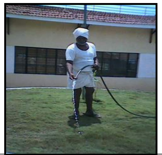
Elders are assigned a return takes our residents are actively involved in taking care of greases by regular watering